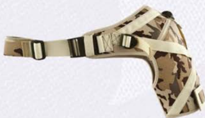
ANATOMIC SHOULDER BRACE