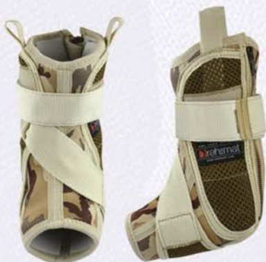
ANKLE BRACE WITH ANATOMIC-SHAPED SHELLS AND ATFL STRAP