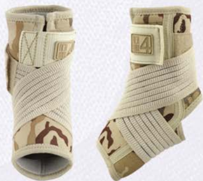
ANKLE BRACE WITH CROSS-STRAPS