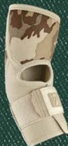
ANATOMIC TENNIS AND GOLFER'S ELBOW BRACE