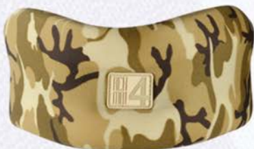
SEMI-RIGID FLORIDA COLLAR

These are medical devices. Use them according to the instructions for use or label.