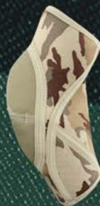
ANATOMIC ELBOW BRACE WITH PROTECTOR

These are medical devices. Use them according to the instructions for use or label.