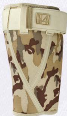
ANATOMIC THIGH BRACE