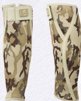
ANATOMIC CALF BRACE

These are medical devices. Use them according to the instructions for use or label.