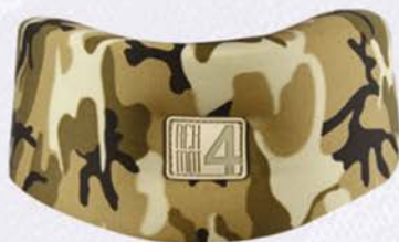
SOFT COLLAR SCHANTZA