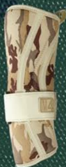
ANATOMIC ELBOW BRACE WITH ORTHOPAEDIC STAYS