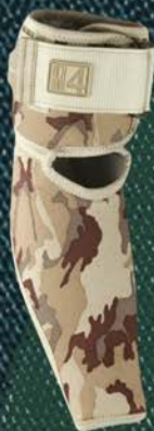
ANATOMIC FOREARM AND ELBOW BRACE