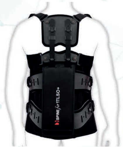
MS-T-01/ TLSO +